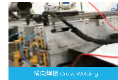
横向焊接 Cross Welding