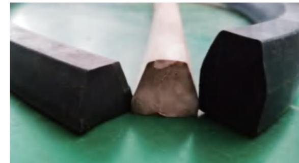
4. V 胶条