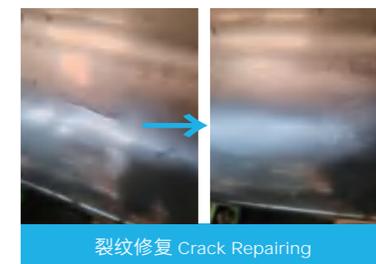
裂纹修复 Crack Repairing