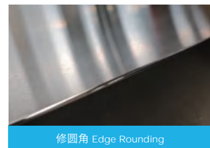
修圆角 Edge Rounding