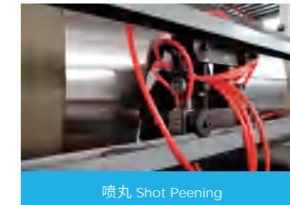
喷丸 Shot Peening