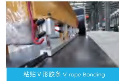
粘贴 V 形胶条 V-rope Bonding