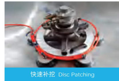
快速补挖 Disc Patching