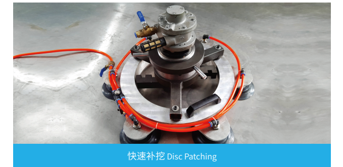
快速补挖 Disc Patching