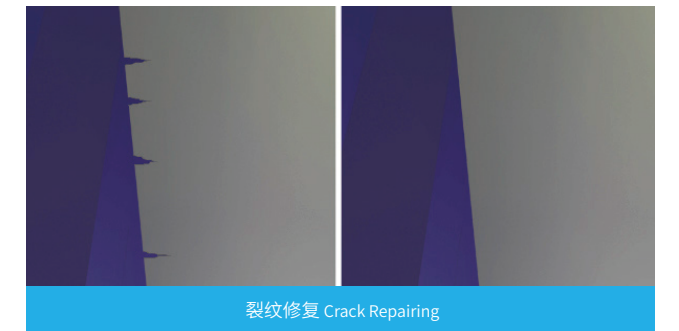
裂纹修复 Crack Repairing